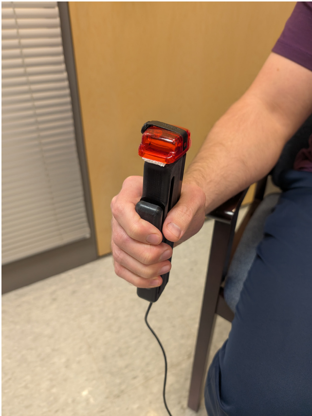
Fig. 1. Electronic Handgrip Dynamometry and Accelerometry.

such as knee extension strength (or muscle power) are related to handgrip strength [6], robustly correlated with physical performance tasks [7], and could be a better predictor of mortality relative to muscle strength [8]. Yet, the use of knee extension strength may necessitate complex and expensive equipment that may not be inclusive of wide-ranging older adult functional abilities, which may compromise use of knee extension strength in clinical settings [2]. The body systems driving poor muscle function are multivariable and poorly operationalized by a single muscle attribute [9]. Therefore, new methods and equipment to feasibly assess additional muscle function attributes should be sought.